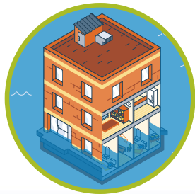
Sewer backup and surface water due to an overflowing lake or river