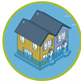
River overflows and enters through windows and doors