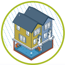
Sewer backup due to a severe rainstorm, but no evidence of surface water