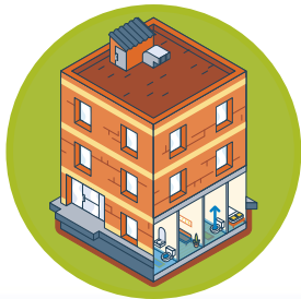
Water enters due to sewer backup

Severe water damage could affect you, your neighbours or your common areas. ARE YOU COVERED FOR THE FOLLOWING SCENARIOS?